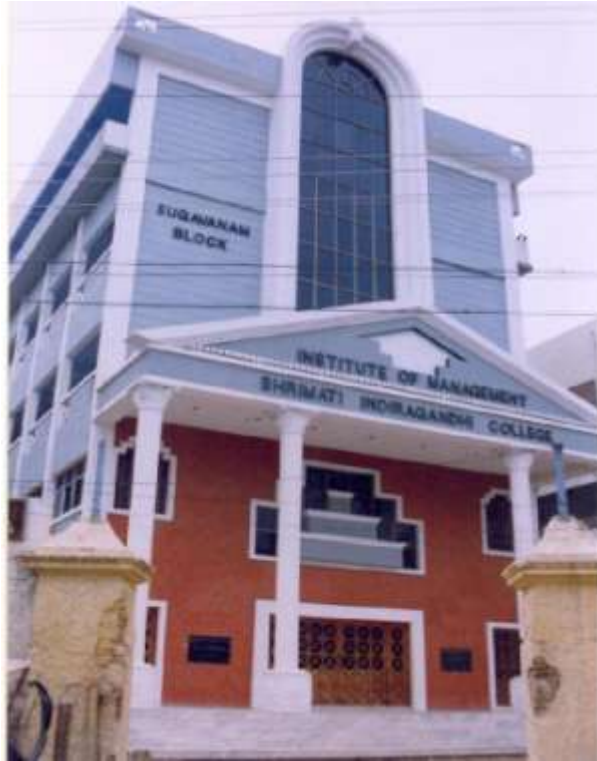
M.B.A BLOCK (B. SUGAVANAM BLOCK)