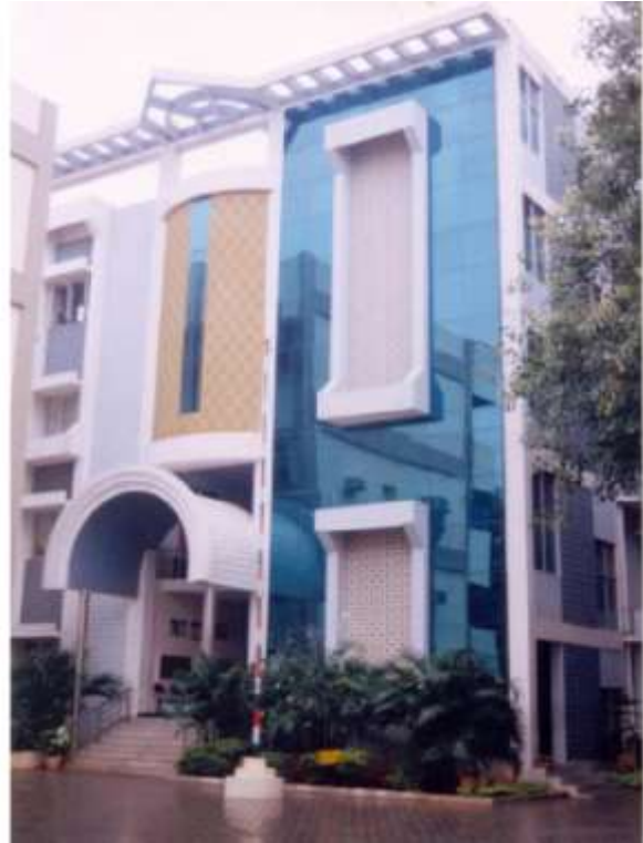
M.C.A BLOCK (PETHACHI CHETTIAR BLOCK)