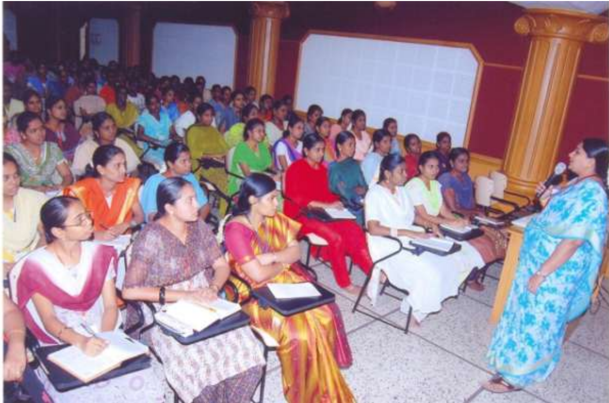
COMMON OPEN AIR AUDITORIUM