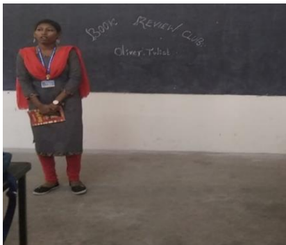
Student reviewed The Scarlet Letter by Novel by Nathaniel Hawthorne

Students are allowed to review literary books of their own choice and evaluate the content on the personal opinion.