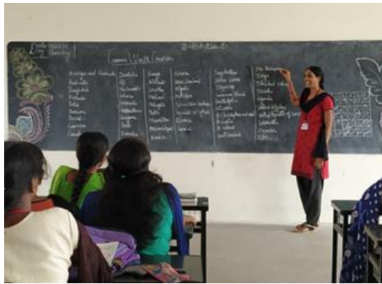
Students took seminar on common Wealth countries.