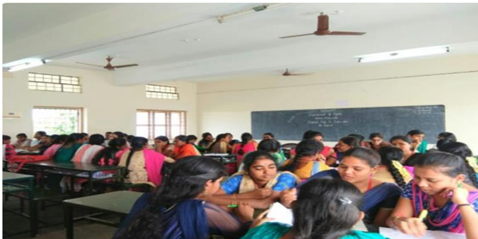
Group discussion on British Rule in India and Its Impact 2019