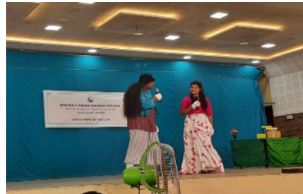
Students Enacted Some of the selected scenes from SHAKESPEARE'S PLAY 2022