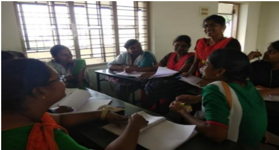
Group discussion on Mulk Raj Anand's Coolie in 2020

Group discussion are conducted to promote deeper understanding of the topic and to encourage development of critical thinking among the students. It also helps them to plan and manage time and develops stronger communication skills