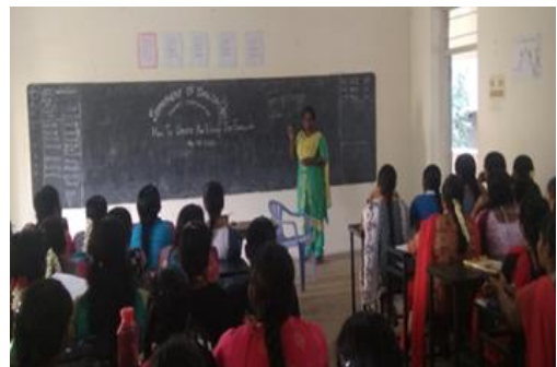
“How to write an Essay in English”