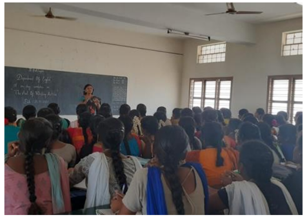
‘The Art of Writing Articles’