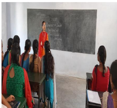
Student reviewed Things Fall Apart Novel by Chinua Achebe