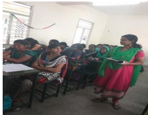
Students took seminar on the Social History of England.