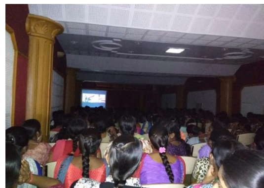
The Sound of Music