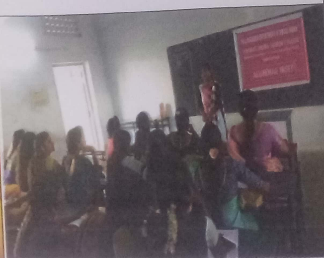
PG& RESEARCH DEPARTMENT OF SOCIAL WORK SCOPE OF SOCIAL WORK