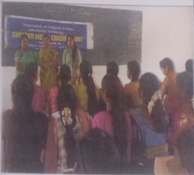
PG & RESEARCH DEPARTMENT OF COMMERCE (M.COM) DIGITAL MARKETING