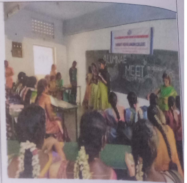
PG & RESEARCH DEPARTMENT OF MATHEMATICS EMPLOYMENT OPPORTUNITIES