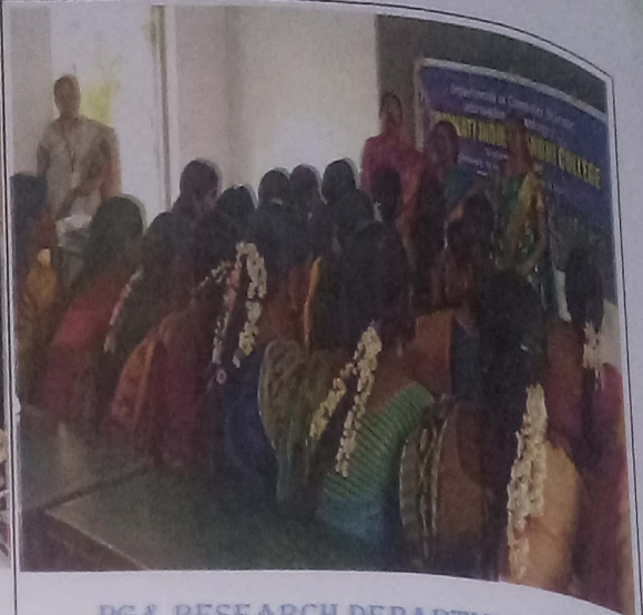
PG & RESEARCH DEPARTMENT OF COMPUTER SCIENCE, IT & APPLICATIONS (M.C.A) CAREER GUIDANCE FOR UNEMPLOYED