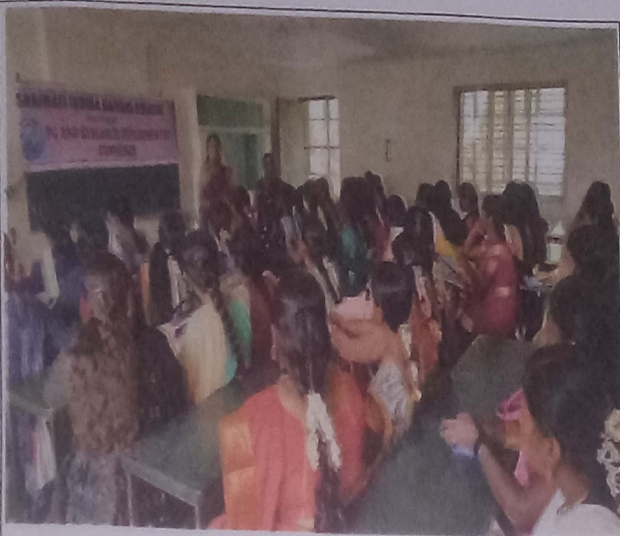
PG & RESEARCH DEPARTMENT OF COMMERCE ONLINE BUSINESS