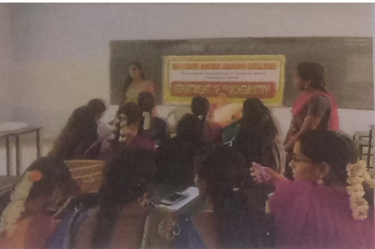
DEPARTMENT OF BIO CHEMISTRY JOB OPPORTUNITIES IN BIOCHEMISTRY