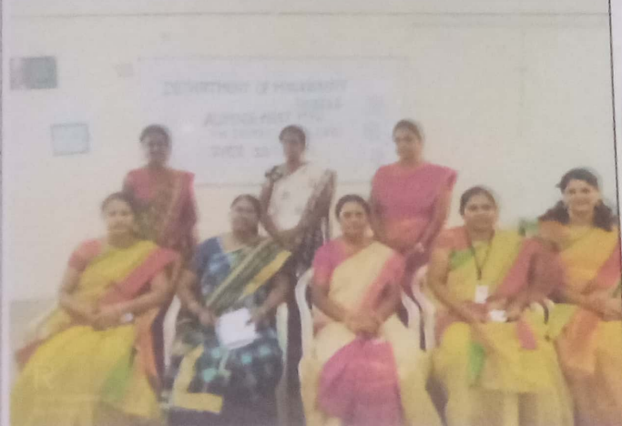
DEPARTMENT OF MANAGEMENT STUDIES THE DREAMERS AND THE DOERS