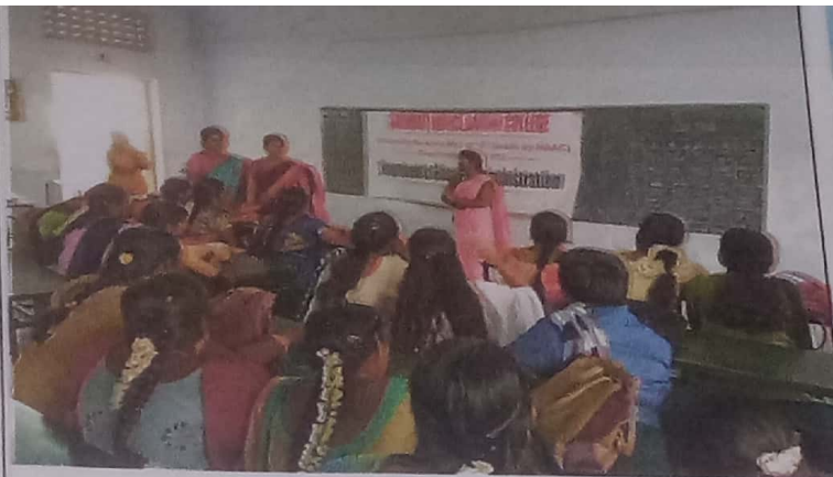
DEPARTMENT OF HOSPITAL ADMINISTRATION JOB OPPORTUNITIES FOR HOSPITAL ADMINISTRATION