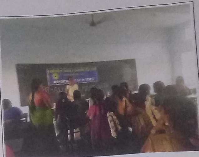
DEPARTMENT OF PHYSICS MOTIVATIONAL TALK