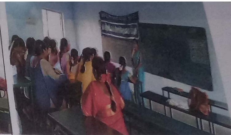
PG & RESEARCH DEPARTMENT OF TAMIL JOURNALISM