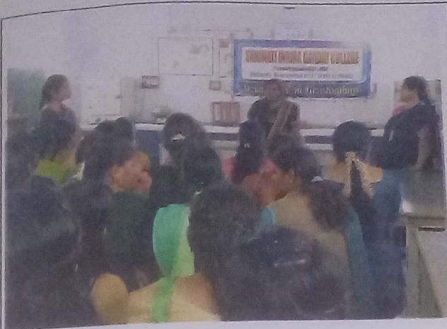
PG& RESEARCH DEPARTMENT OF MICROBIOLOGY 2020 OUTSTANDING ALUMNAE