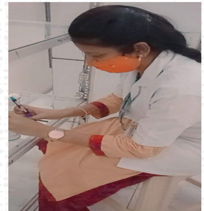
GVN Hospital, Trichy