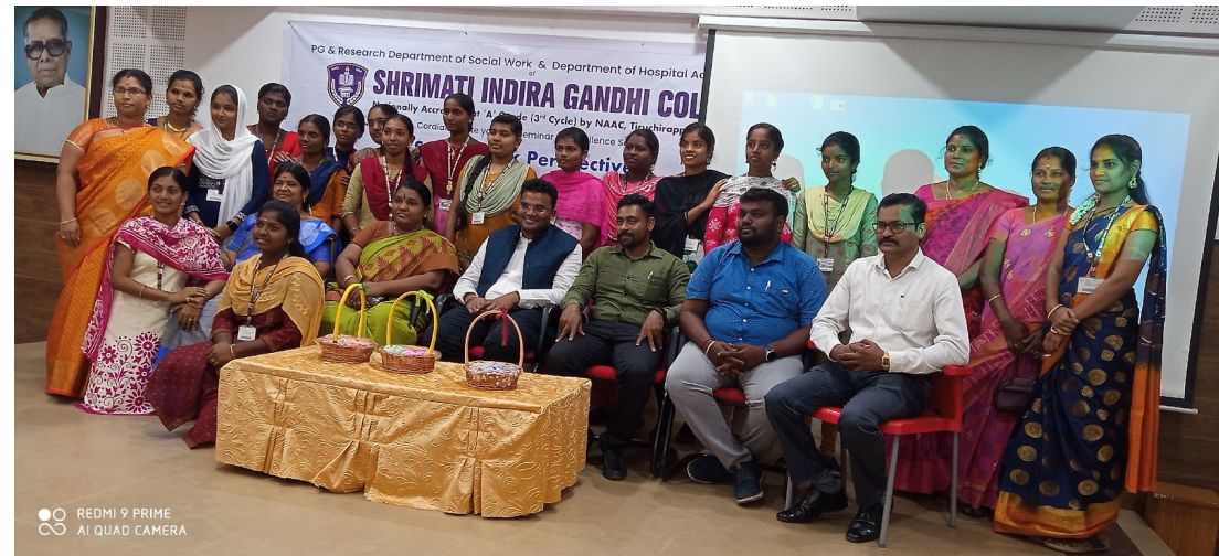
National Seminar on Organ Donation 24/08/2022