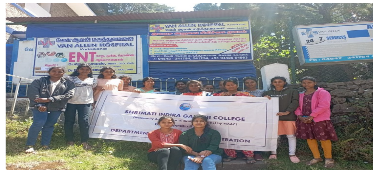
Ven Allen Hospital, Kodaikkanal 11.03.2023