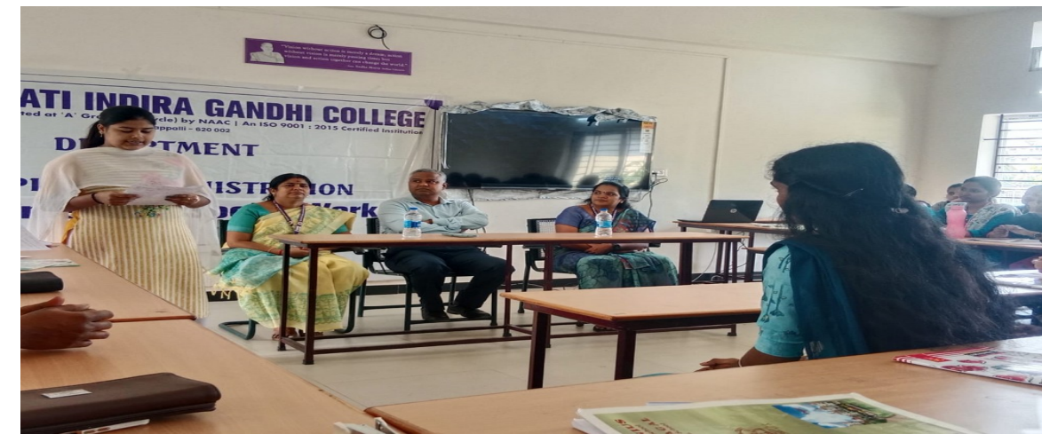
Behavioural Aspects and Professional Development – 20/07/2023