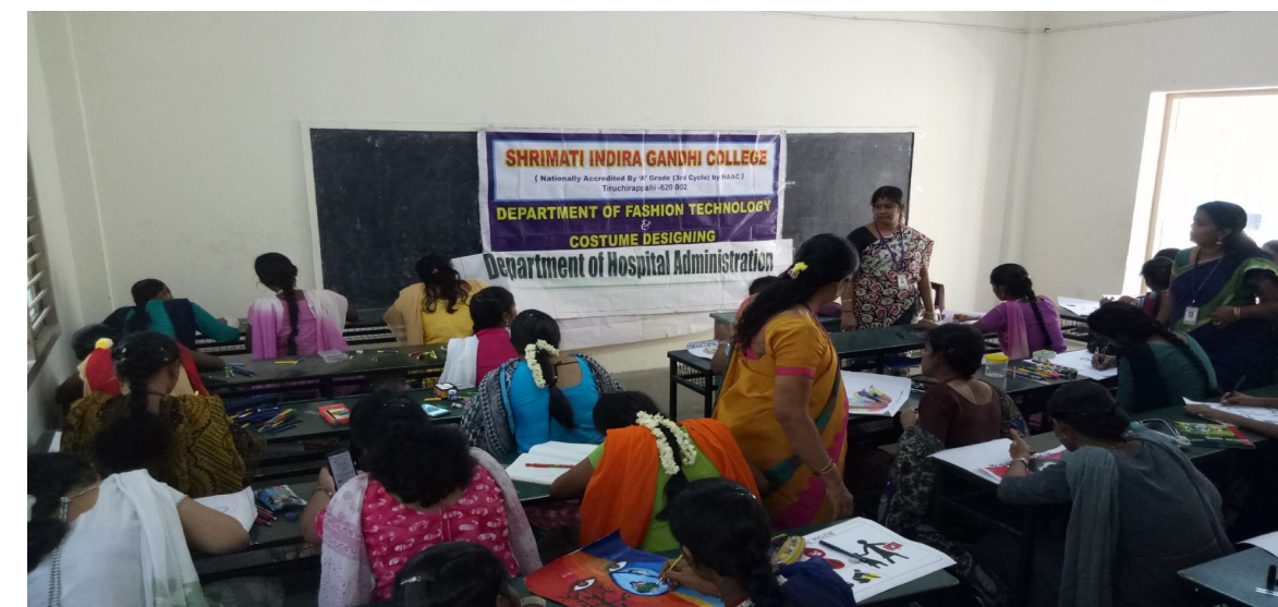
Poster Making Competition on Menstrual Hygiene – 16/02/2019