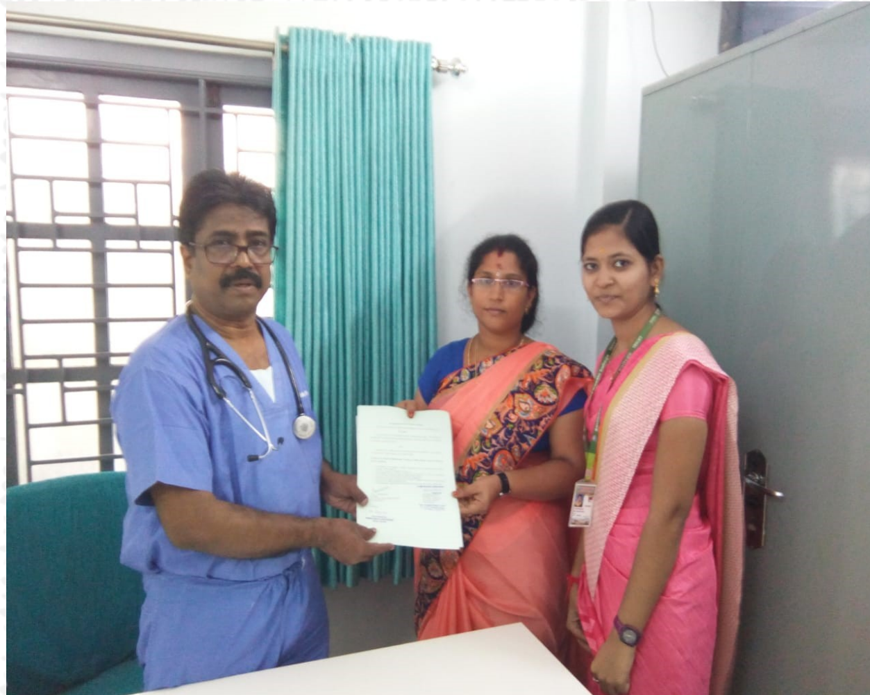
Frontline Hospital, Trichy 2018 - 2020