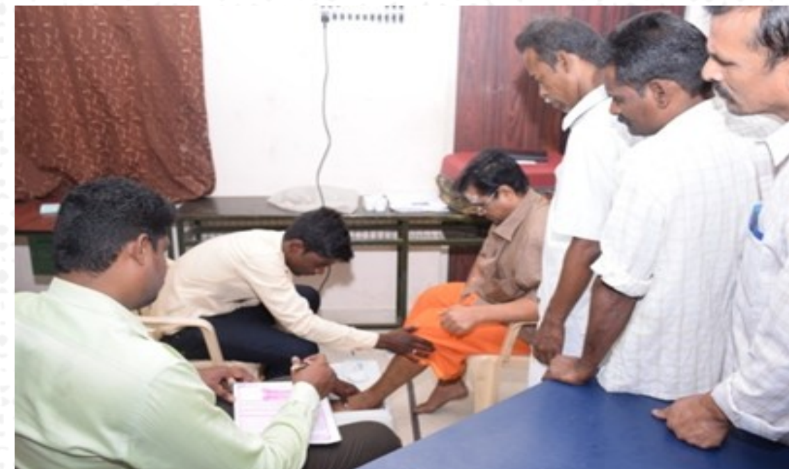
Knee Arthritis on 04.08.2017. Beneficiaries: 200