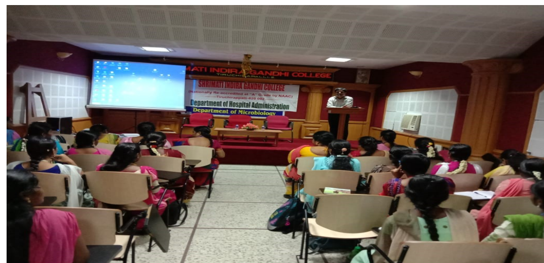
Awareness on Bacterial Diseases 22/02/2019