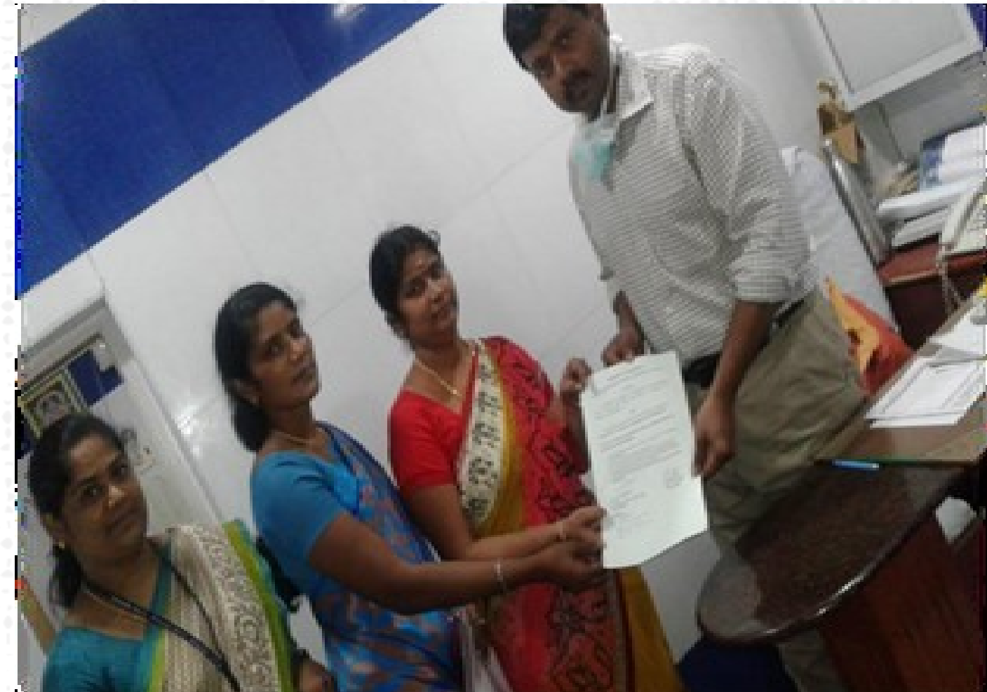
GVN Hospital, Trichy 2018-2020