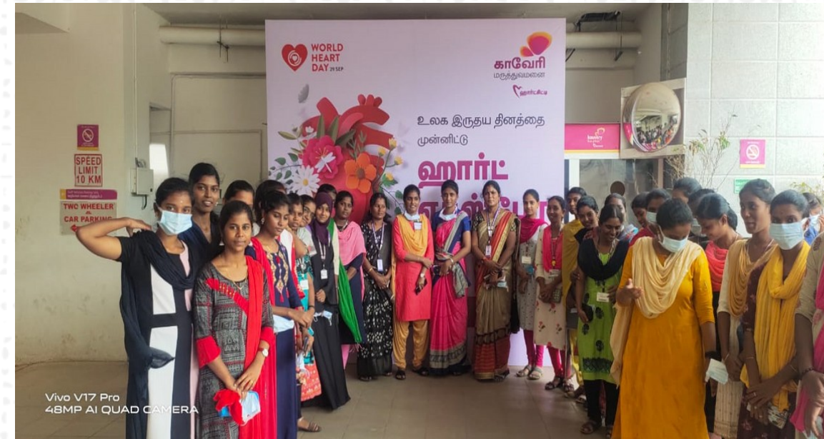
Heart Expo 2022 at Kauvery Hospital, Trichy