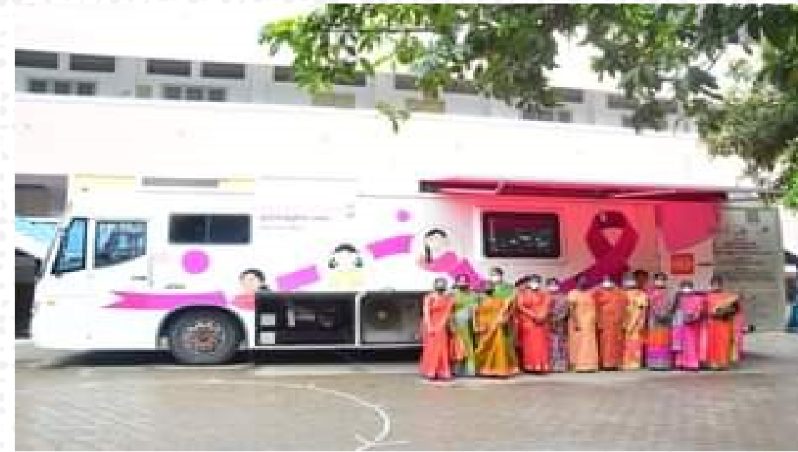
Mammogram on 11.02.2022. Beneficiaries : 60