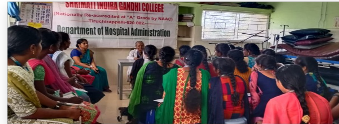
Geethanjali Medical Center, Trichy 08.02.2020