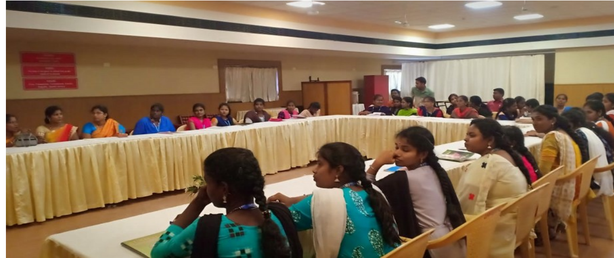
Meenakshi Mission Hospital and Research Center, Madurai 27.02.2020