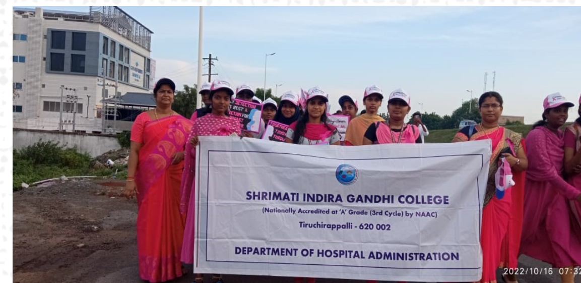
Pinkathon Rally GVN Riverside Hospital, Trichy